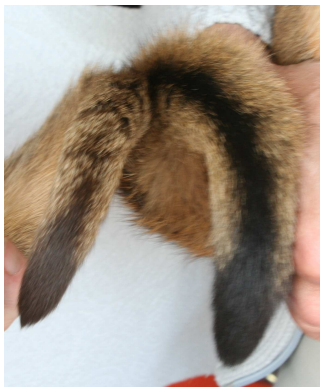
Left picture: chocolate and ruddy

In practice, between a real chocolate cat and a real sorrel cat, a continuum of colour variation exists. This also holds true for the silver varieties, the diluted ones (lilac vs. fawn), and the silver diluted ones. So, how can this be explained ? Of course, one often hears that the variability results from the action of polygenes. This means that, instead of having a character expressing itself according to one of two very different modes, a whole series of other characters intervenes to change a bit the look of the cat, which cannot be modelled easily as bi-modal recessive and dominant genes.