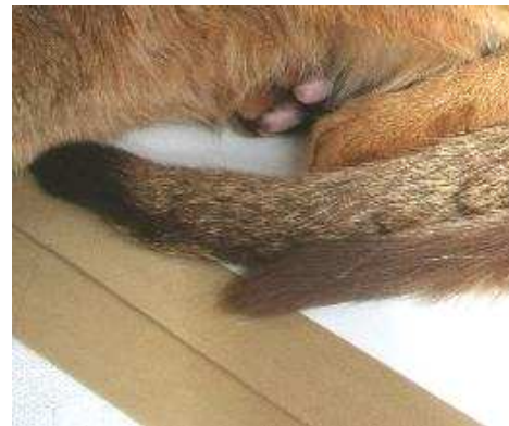
Right picture: chocolate and sorrel

Until now, we have only talked about fully-coloured cats (ruddy, chocolate or sorrel/cinnamon). If we want to cover the so-called “diluted” colours (respectively blue, lilac and fawn), we must take into account another independent locus, called D for dilution. On the D locus, only two alleles are known: the dominant allele D allows full expression of the colour intensity, whereas the recessive allele d gives the cat an appearance of paler colour, hence the “diluted” term. The genetic formula of an intense-coloured cat for the D locus will be either DD (homozygous for the dominant allele) or Dd (carrying dilution), but a diluted cat will always be dd (homozygous for the recessive allele).