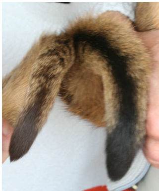
Left picture: chocolate and ruddy

In practice, between a real chocolate cat and a real sorrel cat, a continuum of colour variation exists. This also holds true for the silver varieties, the diluted ones (lilac vs. fawn), and the silver diluted ones. So, how can this be explained ? Of course, one often hears that the variability results from the action of polygenes. This means that, instead of having a character expressing itself according to one of two very different modes, a whole series of other characters intervenes to change a bit the look of the cat, which cannot be modelled easily as bi-modal recessive and dominant genes.