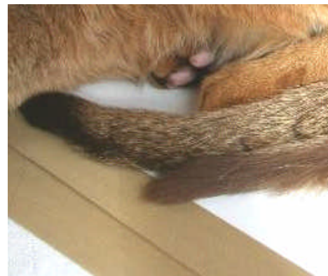
Right picture: chocolate and sorrel

Until now, we have only talked about fully-coloured cats (ruddy, chocolate or sorrel/cinnamon). If we want to cover the so-called “diluted” colours (respectively blue, lilac and fawn), we must take into account another independent locus, called D for dilution. On the D locus, only two alleles are known: the dominant allele D allows full expression of the colour intensity, whereas the recessive allele d gives the cat an appearance of paler colour, hence the “diluted” term. The genetic formula of an intense-coloured cat for the D locus will be either DD (homozygous for the dominant allele) or Dd (carrying dilution), but a diluted cat will always be dd (homozygous for the recessive allele).